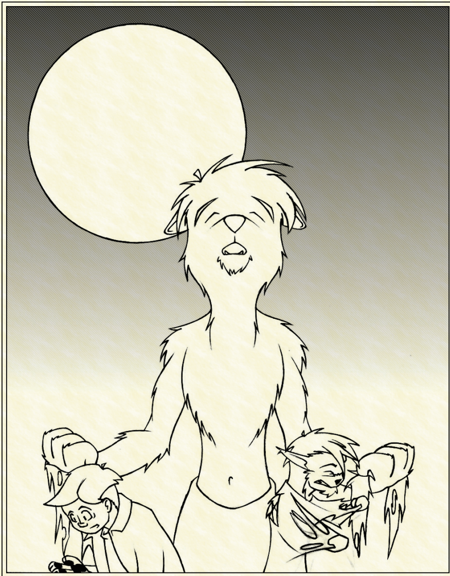
Fig. 1 - The Transformation