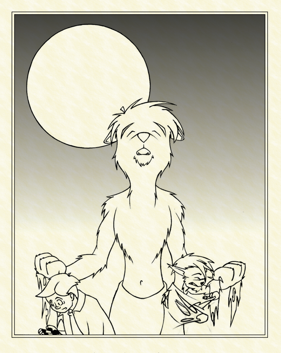
Fig. 1 - The Transformation